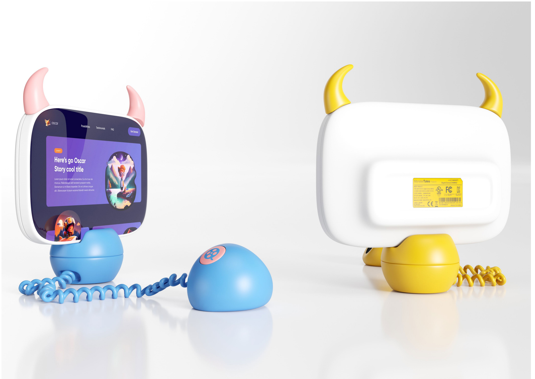
Image 5. Design for Health: Story Magic Box incorporates design elements that consider the health and safety of children. The materials used are child-friendly, and the interactive features are designed to be intuitive and age-appropriate, fostering a secure and enjoyable interaction.