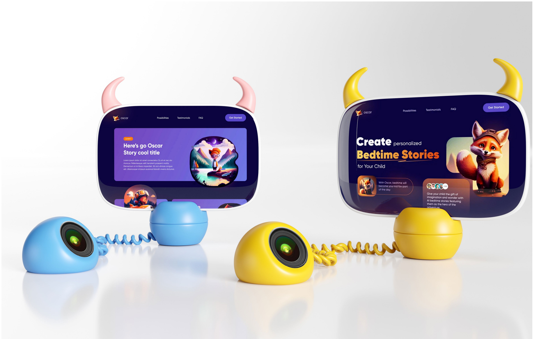
Image 1. Enchanting Storytelling Experience: Story Magic Box delivers an immersive storytelling experience, capturing the attention and imagination of children. The device is designed to weave magical narratives that transport kids' minds to captivating worlds, fostering creativity and joy.