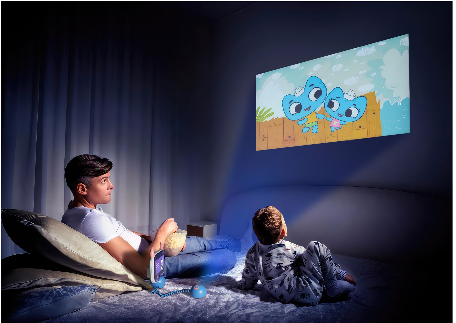
Image 3. Parenting Partnership: Story Magic Box promotes a collaborative parenting approach. Parents can actively engage with their children by using the app to select stories, monitor usage patterns, and even participate in interactive storytelling sessions. This feature strengthens the parent-child bond and encourages shared moments of joy and learning.