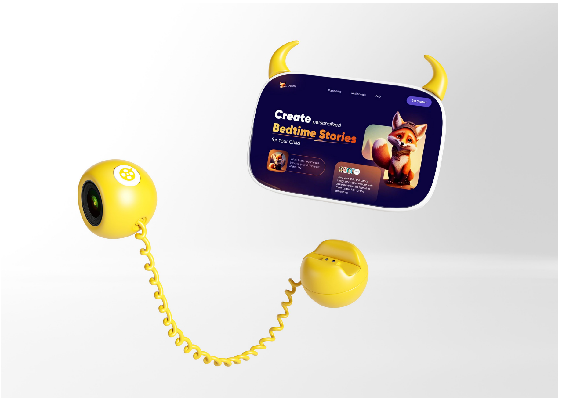
Image 4. Magic Box Design: The physical form of Story Magic Box takes inspiration from a magic box, creating a sense of wonder and excitement for children. The interactive elements and design aesthetics are carefully crafted to engage children in a magical storytelling journey.