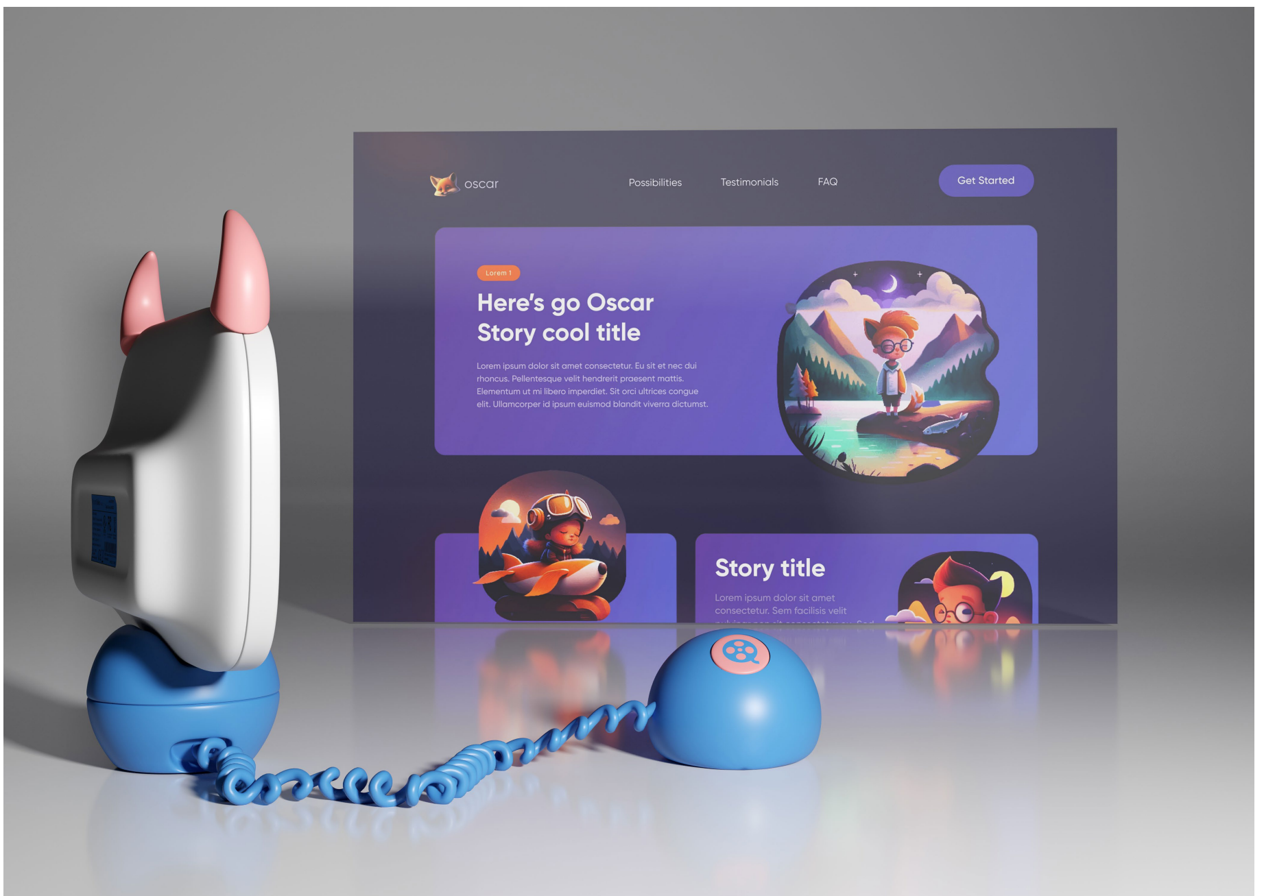
Image 6. Well-being for Kids: The design of Story Magic Box goes beyond entertainment; it prioritises the well-being of children. Each story is thoughtfully curated to convey positive values and life lessons and promote emotional intelligence, contributing to the overall mental health of young listeners.