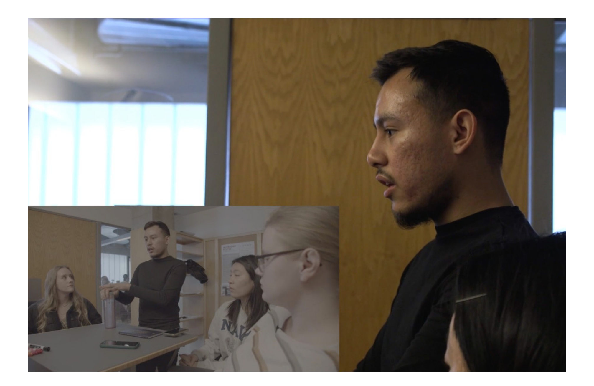
Image 4. Home advocates