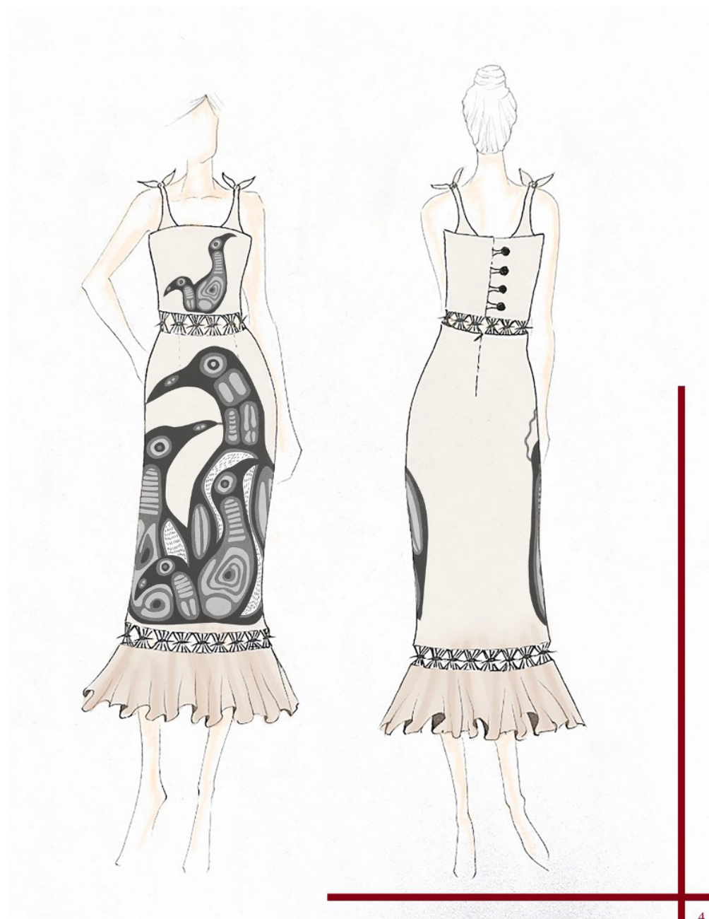
Figure 4: Relationship. Illustrated by: Mansoureh (Sophie) Nikookar.