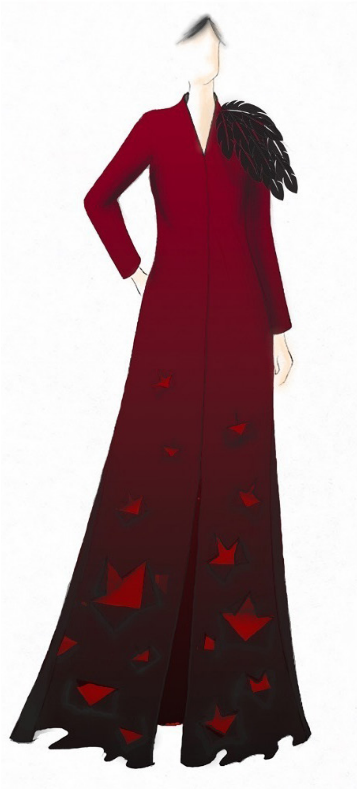
Figure 5: Identity and Healing. Illustrated by: Mansoureh (Sophie) Nikookar.