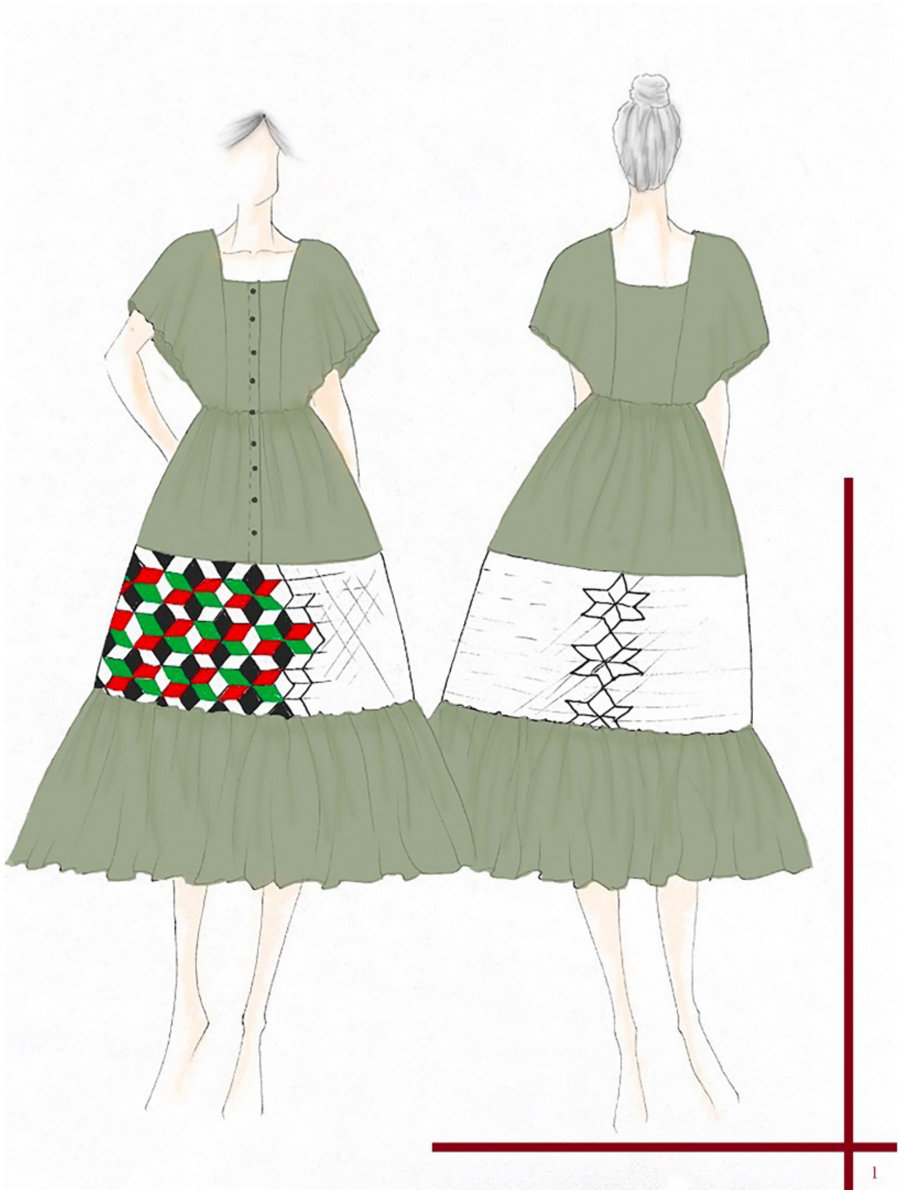
Figure 1: Community. Illustrated by: Mansoureh (Sophie) Nikookar.