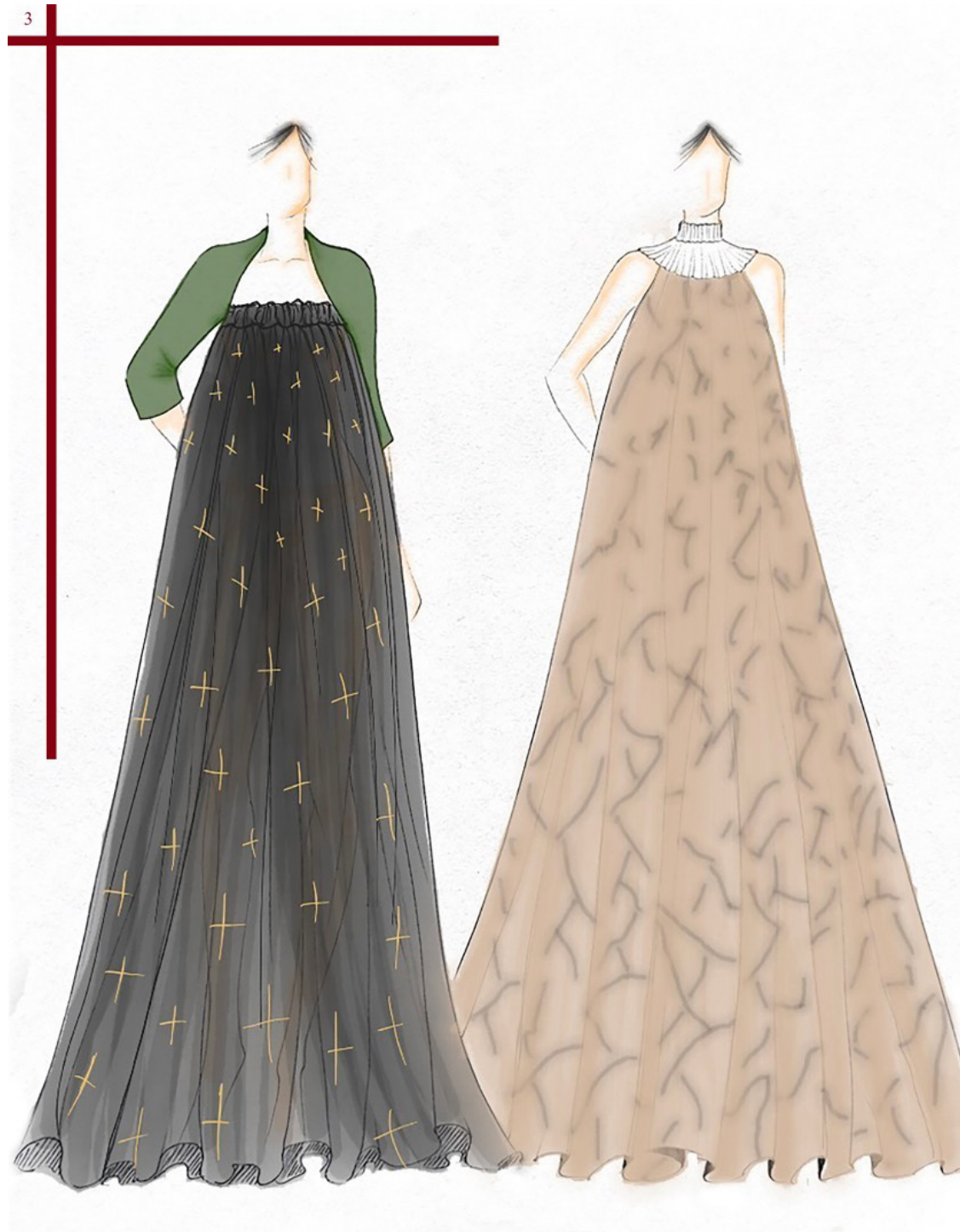
Figure 3: Spirituality (Left) / Connection to the Land (Right). Illustrated by: Mansoureh (Sophie) Nikookar.