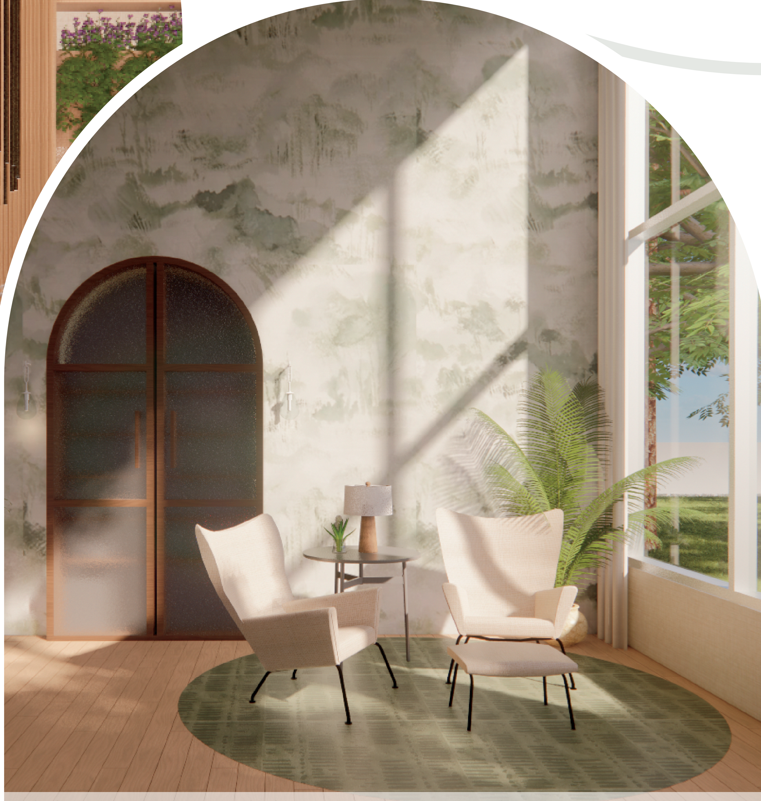
COMMUNITY ROOM - INTIMATE SEATING