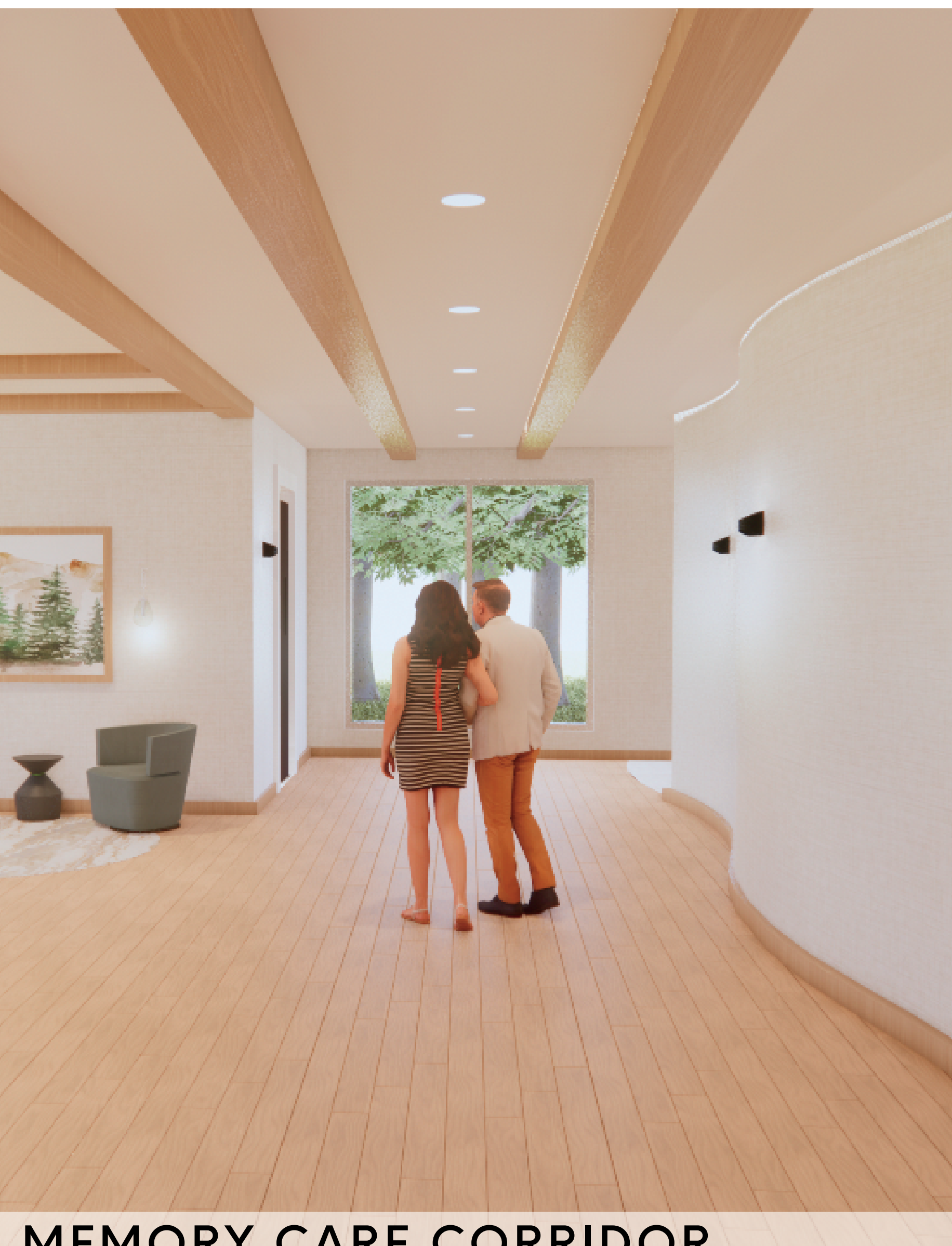
MEMORY CARE CORRIDOR