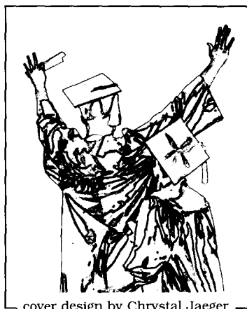
cover design by Chrystal Jaeger