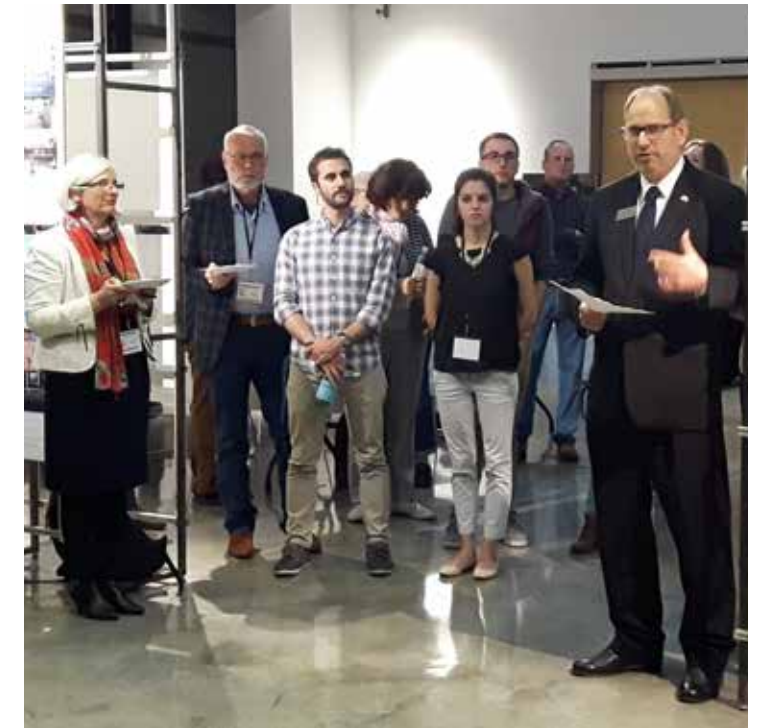
Symposium: Complexity: Dutch & America Housing

These three projects are related to each other. The book and exhibition introduce, describe and analyze a special form of housing that was built in the Netherlands between 1990 and 2010, here called "complex housing." Complex housing is defined as comprising: