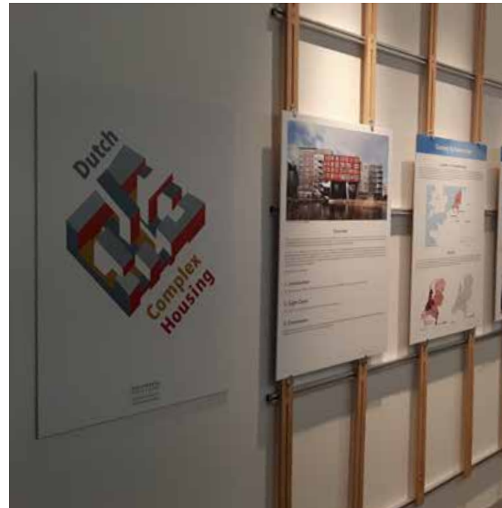
Exhibition: Dutch Complex Housing